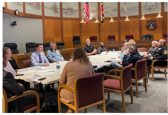
On April 22, 2024, the Project Team met with the City of Havre de Grace Street & Traffic Advisory Board to discuss anticipated traffic impacts.

Amtrak is working closely with the recently selected contractor, Flatiron/Herzog Joint Venture, to continue to develop means and methods for the major bridge construction. The Project Team is committed to prioritizing safety, cost, and schedule throughout this process. Major construction is anticipated to start in late 2025. In the meantime, Amtrak is completing early work activities including the removal of the 1866 remnant piers and coordination with Baltimore Gas and Electric (BGE) for a transmission tower relocation. Amtrak is also continuing to meet with stakeholders including the neighboring municipalities, school boards, emergency services, and local chambers of commerce to raise awareness about the project and address questions.