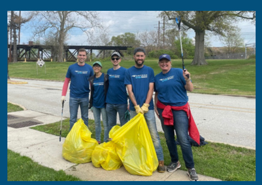
Amtrak volunteers participating in the 2024 River Sweep in the Town of Perryville.

Amtrak strives to be a good neighbor and valuable partner to the communities we serve by raising awareness of projects, being present in the community through various local events and programs. and partnering with community groups to make a positive impact. Amtrak was pleased to volunteer at the Lower Susquehanna Heritage Greenway's 24th Annual River Sweep. During the River Sweep, members of the Project Team participated in a shoreline cleanup in the Town of Perryville in celebration of Earth Day. The Project Team is looking forward to supporting and participating in other community events in the Town of Perryville this summer. Additionally, in the City of Havre de Grace, the Project Team was happy to host an outreach table at the May First Friday street festival where the team handed out project information and spoke with local community members about the project. Amtrak will be participating in the City's First Friday events throughout the spring, summer and into the fall.