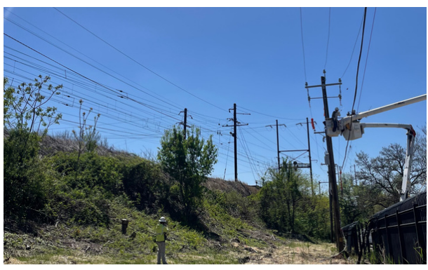
Delmarva undergrounding utilities prior to the BGE Tower Relocation Project.

The BGE Tower Relocation Project is an early work activity that will relocate transmission infrastructure located intersection of Broad Street and Roundhouse Drive in the Town of Perryville. The transmission infrastructure is currently in the path of the Amtrak Susquehanna River Rail Bridge Project. Amtrak, Delmarva, and BGE worked in a cooperative effort to relocate a portion of Delmarva electrical lines underground at the end of April 2024. By relocating this section of overhead lines, this will result in less disruptions to Perryville customer service during BGE's tower relocation work. BGE will begin removing the existing transmission tower and installing two monopole structures in July 2024.