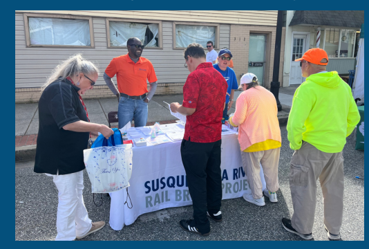
Amtrak outreach table at the May First Friday event in the City of Havre de Grace