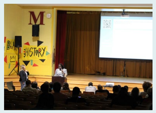
The presentations for both the March and May bi-monthly meetings are available on the Community Outreach section of the Program website, Amtrak.com/FDTunnel.